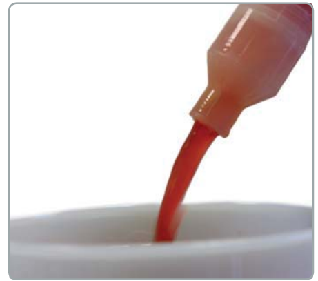
Quick & easy to use