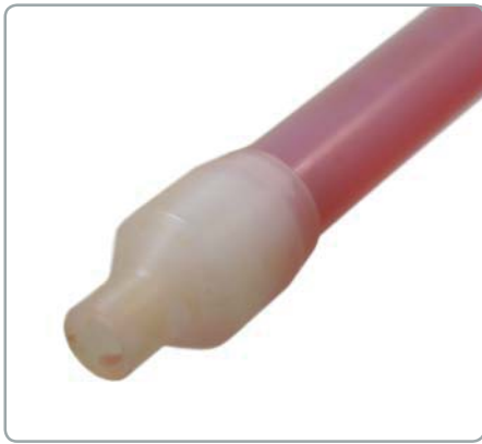
Sampler Tip Seal arrangement prevents sample from dripping