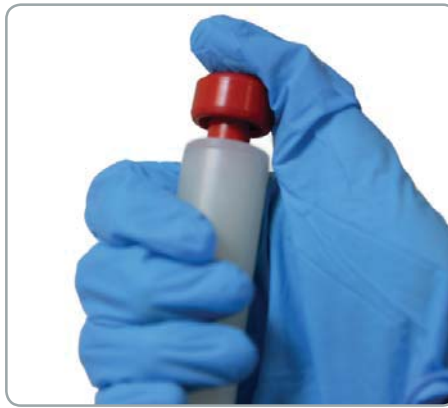
Push Button Press to take sample