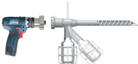
PowerPowder for horizontal and vertical use